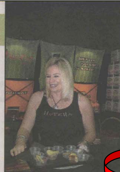
The Salsa Queen from San Marcos Hotcha Salsa takes a stand against naked chips